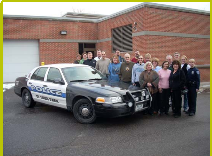
2008 Citizen's Academy