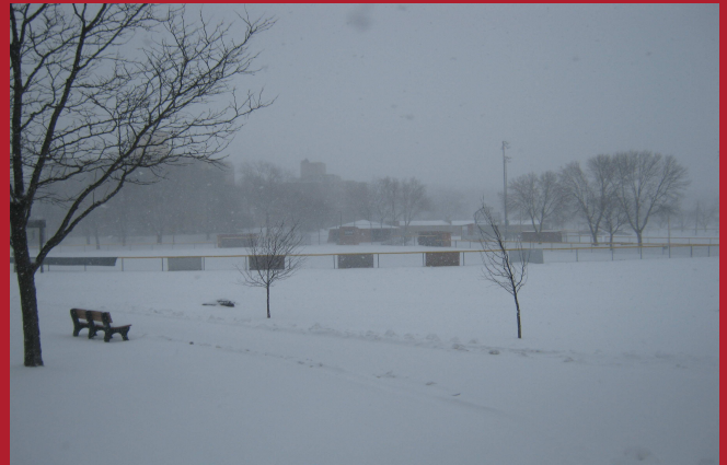
Winter continued its grip on St. Louis Park as seen in this photograph of Skippy Field during the March 23rd snowstorm.