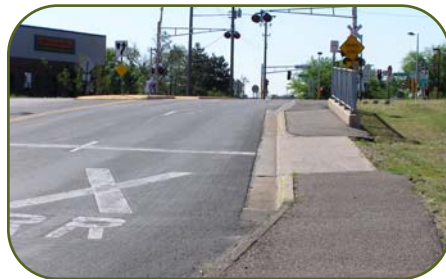
Narrow trail connection on both sides of Wooddale Avenue to Highway 7