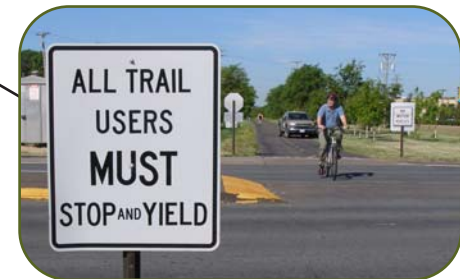
No marked crosswalk - Vehicles are NOT required to stop for trail users