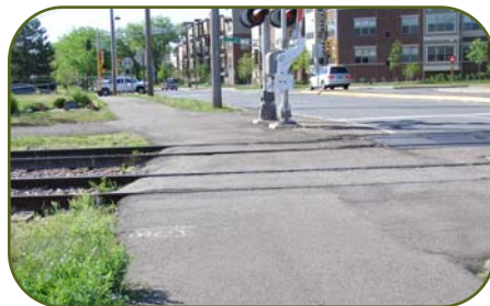
Railroad crossing is inconsistent