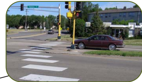
The crooked crosswalk is difficult to follow for visually impaired pedestrians.